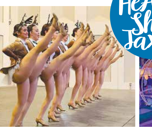
Children's Music Programs