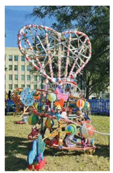
Grateful For Ongoing Community Support, Especially From Our Public Partners

Showcasing creativity in public park space featuring decorated lifeguard chairs with children's holiday music and dance stage programming.