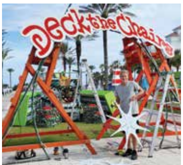
JBDTC Build/Decorate Support