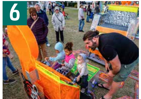
EDUCATION | INSPIRATION