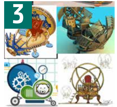
PRESENTING CONCEPTS: TIME MACHINE