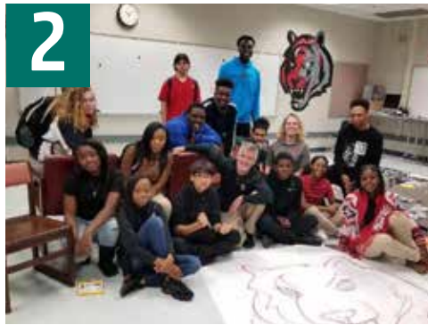
PLANNING WITH STUDENTS

DEDICATED MAGNET PROGRAMS: AVIATION IN MILITARY SCIENCES (AFROTC) SPORTS MEDICINE AND MARKETING CYBERSECURITY VIDEO GAME DEVELOPMENT ACCELERATION PROGRAM: EARLY COLLEGE - ASSOCIATES OF SCIENCE AP COMPUTER SCIENCE PRINCIPLES CAREER PATHWAYS: HEALTH & WELLNESS EXERCISE SCIENCE SPORT RECREATION & ENTERTAINMENT MARKETING PERSONAL TRAINER APPLIED CYBERSECURITY GAME/EMULATION/ANIMATION PROGRAMMING WEB DEVELOPMENT