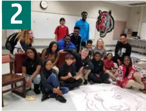
PLANNING WITH STUDENTS

DEDICATED MAGNET PROGRAMS: AVIATION IN MILITARY SCIENCES (AFROTC) SPORTS MEDICINE AND MARKETING CYBERSECURITY VIDEO GAME DEVELOPMENT ACCELERATION PROGRAM: EARLY COLLEGE - ASSOCIATES OF SCIENCE AP COMPUTER SCIENCE PRINCIPLES CAREER PATHWAYS: HEALTH & WELLNESS EXERCISE SCIENCE SPORT RECREATION & ENTERTAINMENT MARKETING PERSONAL TRAINER APPLIED CYBERSECURITY GAME/ANIMATION PROGRAMMING WEB DEVELOPMENT