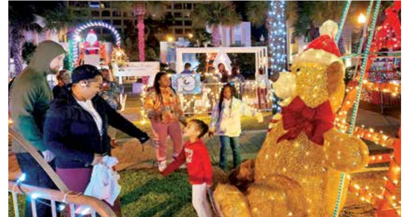
2022 JBDTC celebrated its tenth season with more than 50 decorated chairs