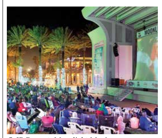
CoJB Present, Moonlight Movies