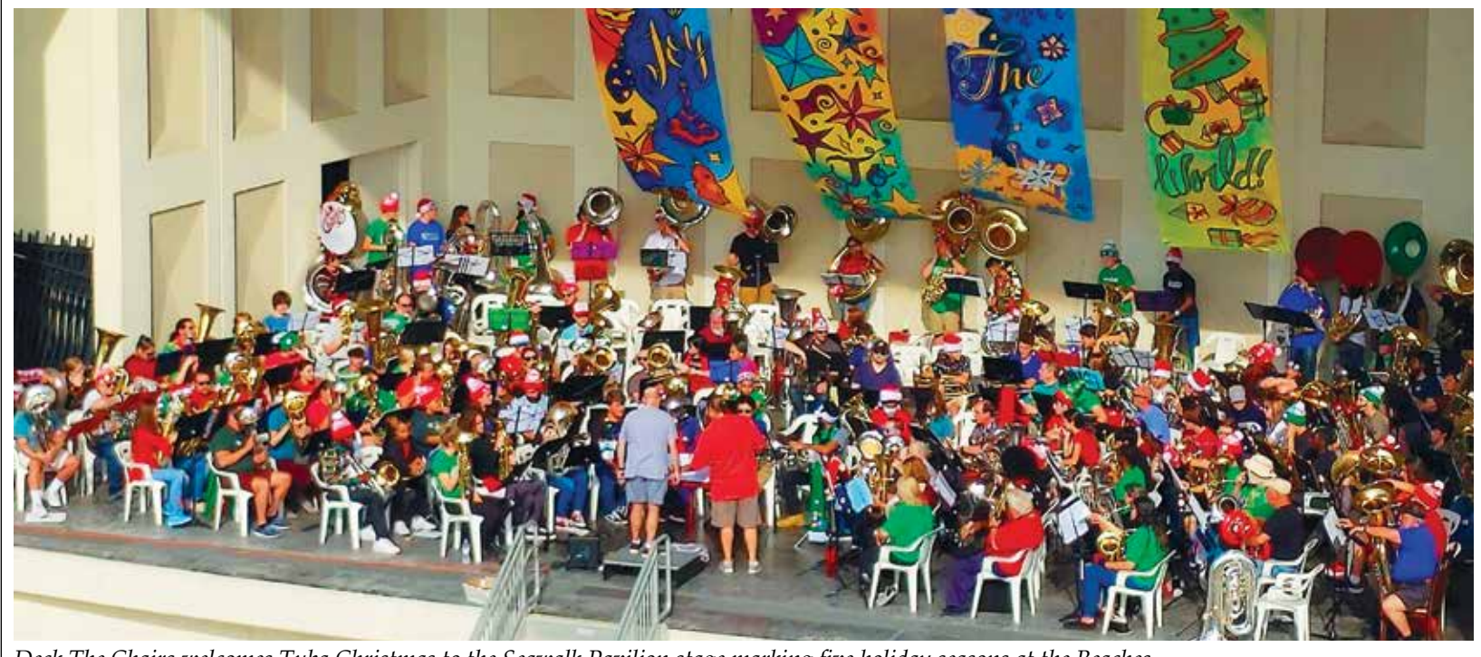
Deck The Chairs welcomes Tuba Christmas to the Seawalk Pavilion stage marking five holiday seasons at the Beaches.