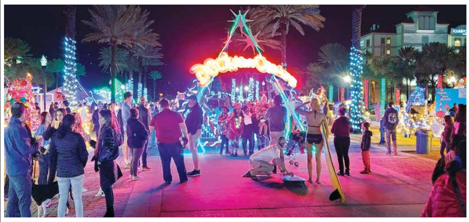
Iacksonville Beach Deck The Chairs entrance has welcomed more than .5 million visitors since 2013

Through your continued support, Deck The Chairs (DTC) has become one of north Florida's most impactful community arts organizations.