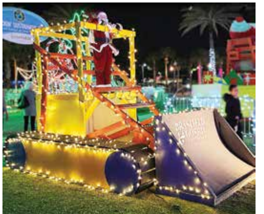
More than 50 decorated lifeguard chairs