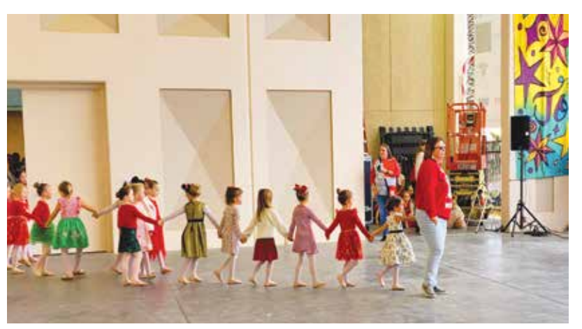
More than 30 hours of free arts programming is showcased annually.