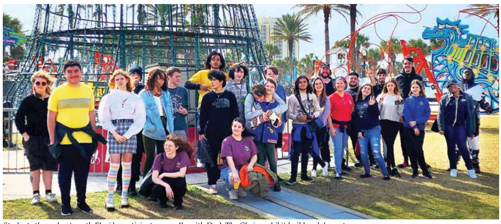
Students throughout north Florida participate annually with Deck The Chairs exhibit build and decorate.