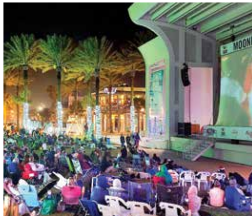
CoJB Present, Moonlight Movies