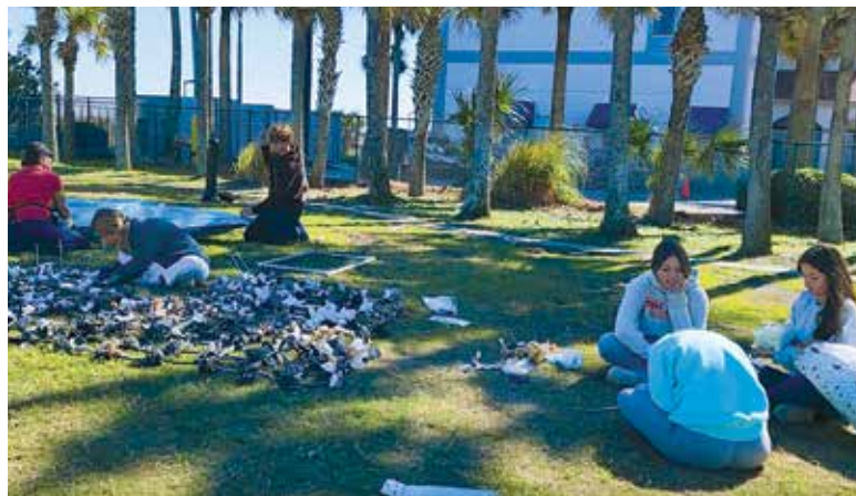
Six north Florida schools participated in the 2022 BGG Student Exhibit.