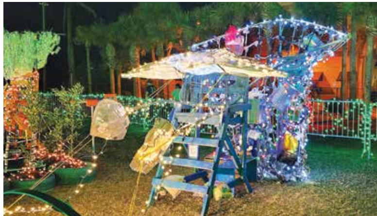
Bolles School creative chair display and use of repurposed materials