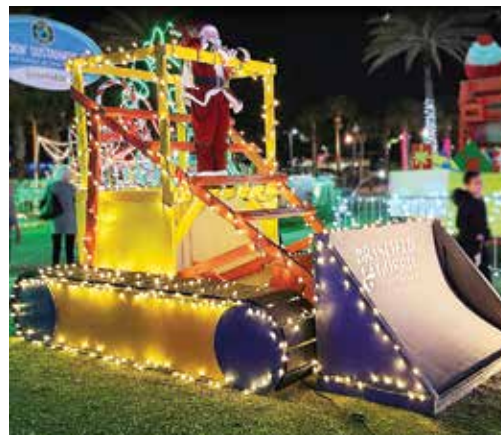
More than 50 decorated lifeguard chairs