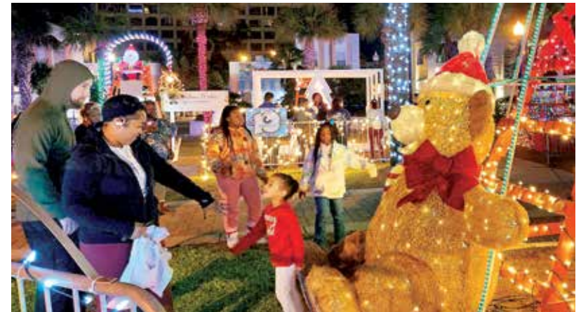
2022 JBDTC celebrated its tenth season with more than 50 decorated chairs