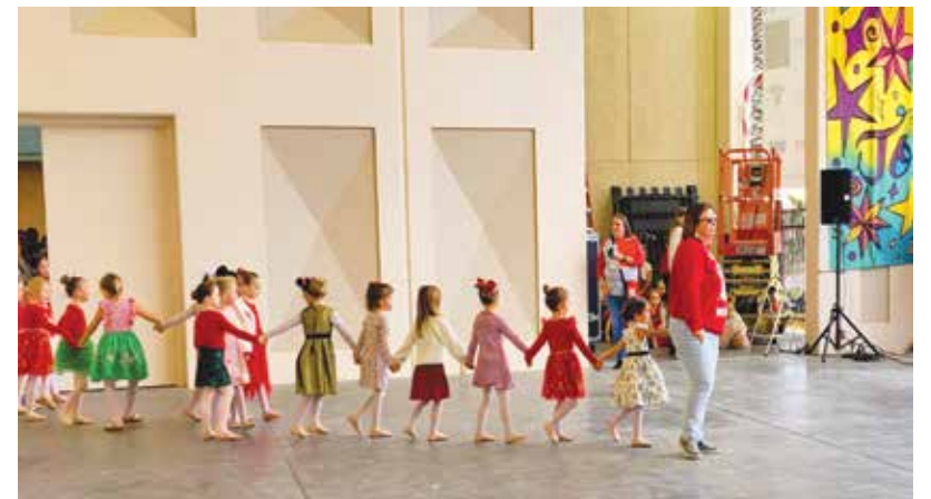
More than 30 hours of free arts programming is showcased annually.