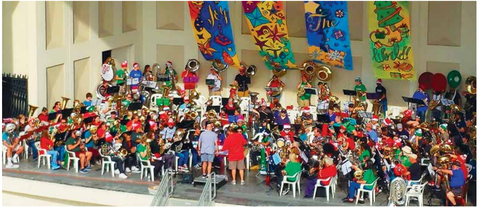
Deck The Chairs welcomes Tuba Christmas to the Seawalk Pavilion stage marking five holiday seasons at the Beaches.