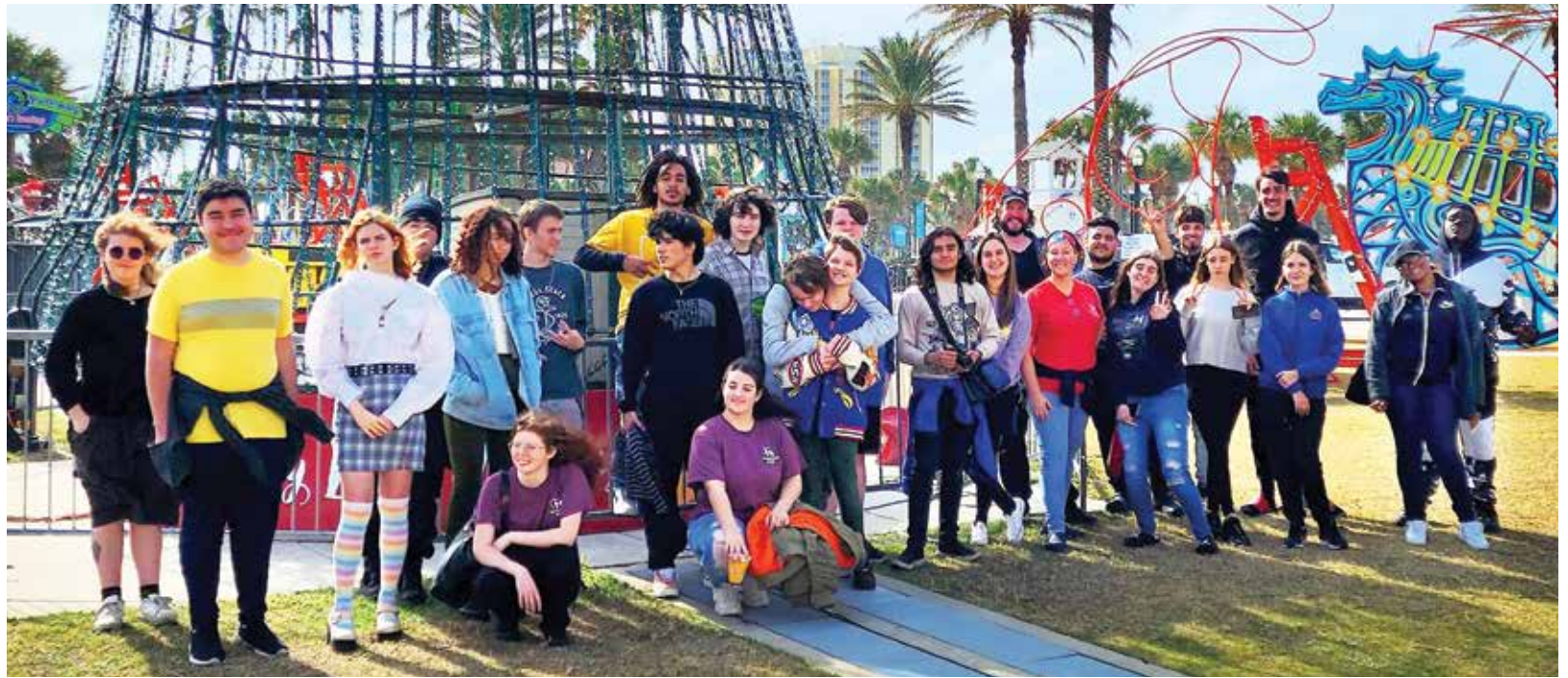
Students throughout north Florida participate annually with Deck The Chairs exhibit build and decorate.