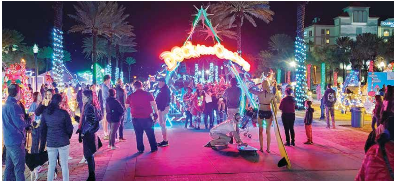
Jacksonville Beach Deck The Chairs entrance has welcomed more than .5 million visitors since 2013

Showcasing creativity in public park space featuring decorated lifeguard chairs with music and dance programming.